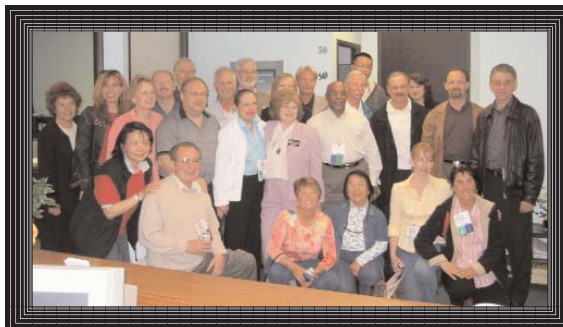
Network with industry professionals

Gain access to national and regional real estate sector networking opportunities